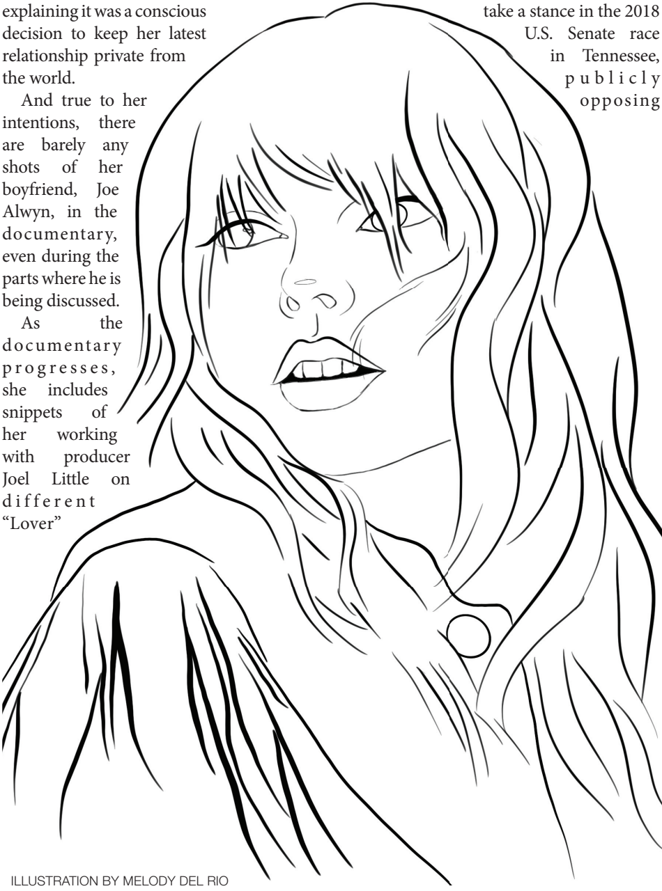
ILLUSTRATION BY MELODY DEL RIO